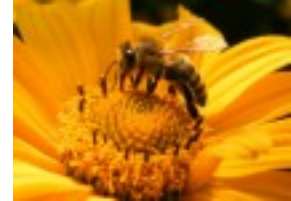
Bees Prefer Nectar, Pollen of Pesticide-Treated Plants