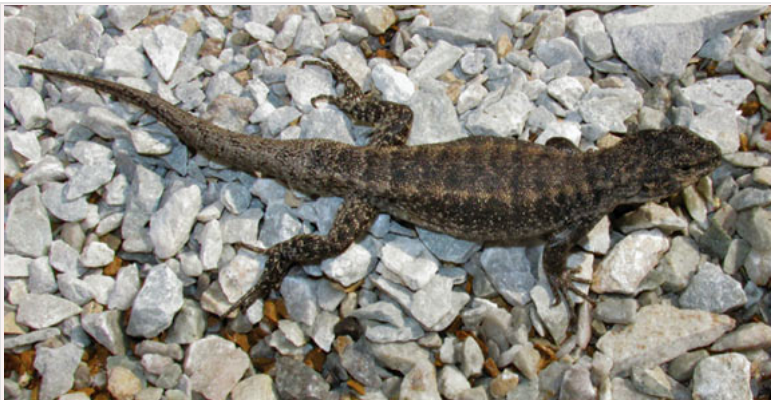
Liolaemus zabalai, male, near Los Barros, Laja Lagoon, Biobio Region, Chile.