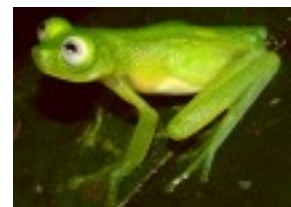
Hyalinobatrachium diana: New Species of Glassfrog Discovered in Costa Rica