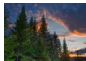
Color of Light Influences Circadian Clock in Mammals, Scientists Say