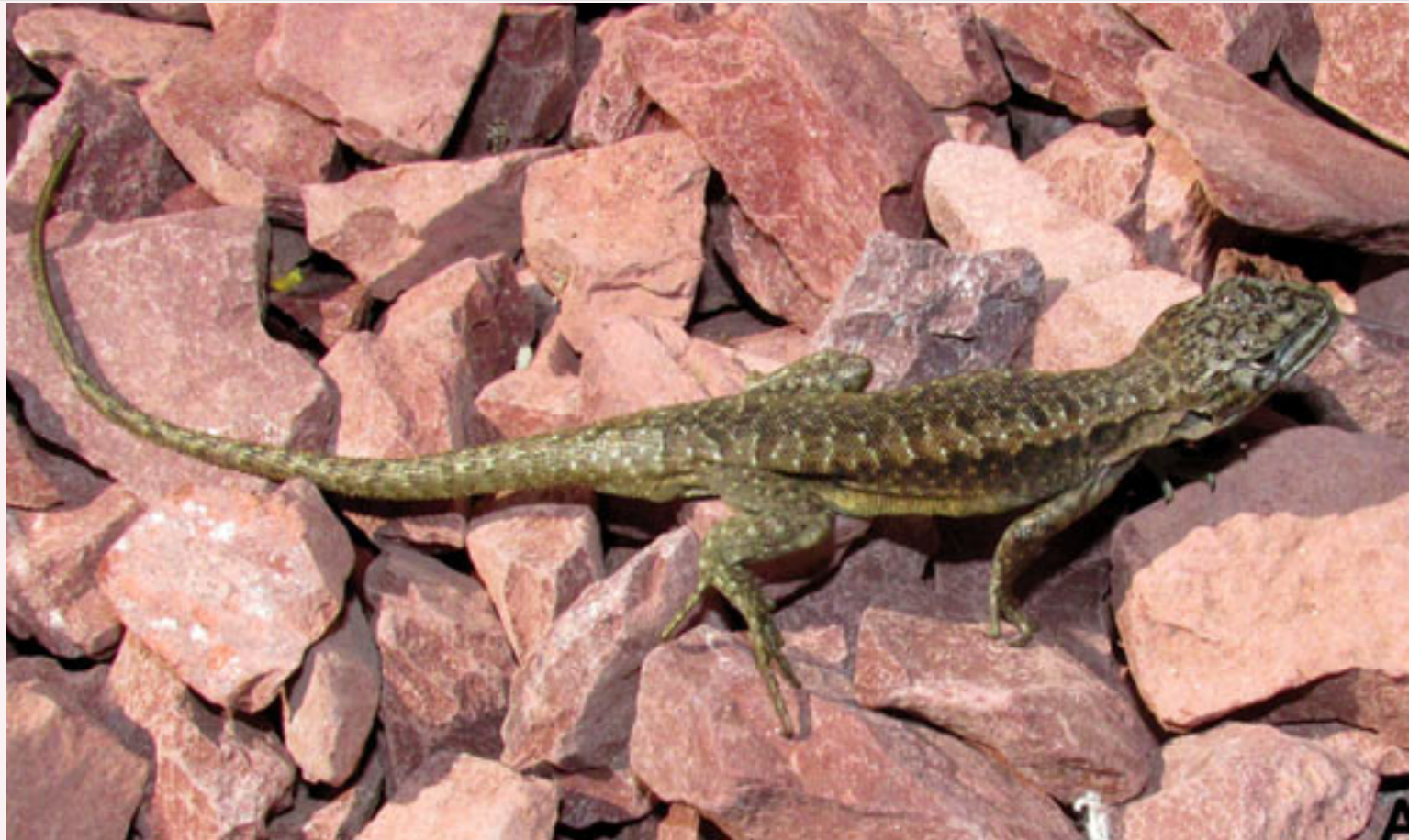
Liolaemus scorialis, male, 7 km NW of the summit of the Antuco Volcano, near the Laja Lagoon, Biobío Region, Chile.