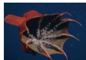
Vampire Squid Possesses Unique Reproductive Strategy